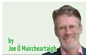
by Joe Ó Muircheartaigh

Instead of being the guts of ten points up at that juncture Clare found themselves level — the disparity between what was and what should have been being all down to not tak-